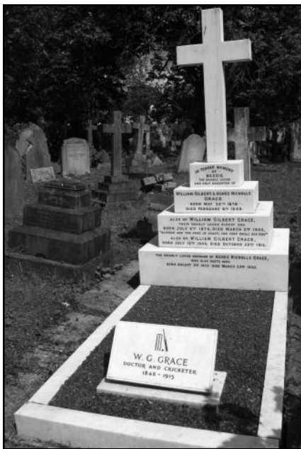
Grave of Dr W G Grace (cricketer)