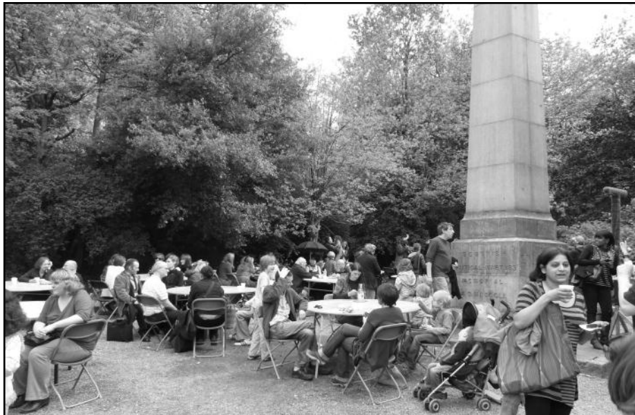
Open Day in Nunhead Cemetery 2012

No 117 -- Autumn (September - November 2012) -- ISSN 1478-0631