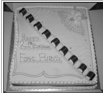
Publications & inquiry desk 21st Birthday cake on display at AGM in June

We are always looking for new volunteers. Please contact us if you are interested in helping on the Sunday inquiry desk. Who knows? We might even be able to expand into Saturdays. Contact treasurer@fonc.org.uk .