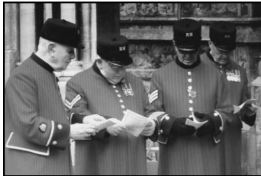
Chelsea Pensioners at Nunhead.