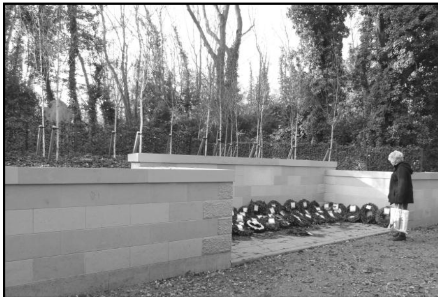
New First World War Memorial in Nunhead (see page 10)

No 119 - Spring (March - May 2013) - ISSN 1478-0631