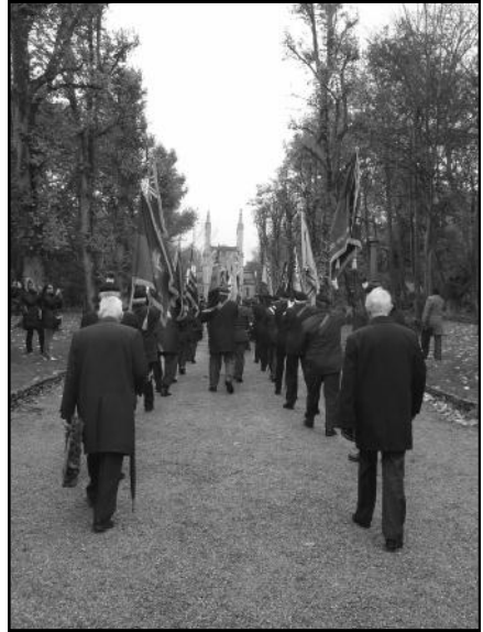
Standard bearers of the Royal British Legion at the rededication service.