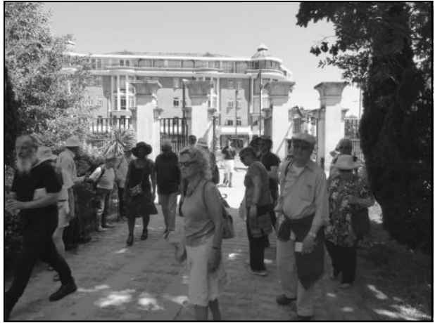
A group of FONC members set off on a tour of Abney Park Cemetery

bringing Asian and African animals to the attention of the Victorian public. During the tour, our enthusiastic guide recounted fascinating histories of some of residents including the first female solo balloonist, Margaret Graham, who described herself as the 'only English Female Aeronaut'. Ballooning was not for the faint hearted as she experienced several crashes including one during a flight to commemorate Queen Victoria's coronation! Another person buried there is one of history's most infamous and sadistic hangmen, William Calcraft, who personally dispatched as many as 400 felons over the course of his 45 year career. It was noted that he was buried as 'Calcroft' to protect his resting place from revenge attacks.