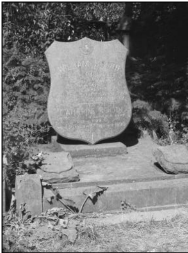
General William Booth's Memorial in Abney Park