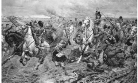
The Charge of the Royal Scots Greys

The stories of these veterans make for amazing reading, especially the after-math of the battle. There's a lieutenant-colonel whose career spanned 81 years, eventually becoming a field marshal. Several of the veterans end up in the workhouse, though happily they become friends with each other there and, at the end, they are provided with due burial honours and avoid the anonymity of paupers' graves. Touchingly, the veterans are buried together.