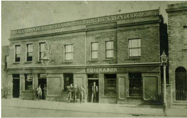
The Newlands Tavern, Peckham Rye

In 1878, for example, it was noted at the licensing sessions, not for the first time, that ‘The house is placed between Peckham Rye and New Cross on the main road, the nearest house being The Nun’s Head... which does not oppose the application’. It was further noted that, ‘There are several games indulged in near the house, including that of football, the players of which are unable, unless going a long way out of their course, to obtain spirits in the shape of brandy, whisky etc.’ Despite these favourable circumstances, the licence was still not granted.