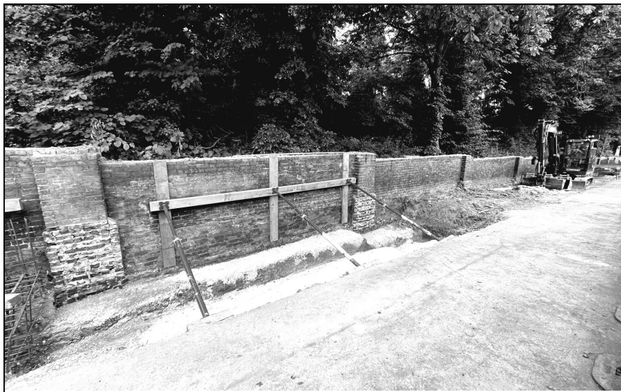
New boundary wall in Limesford Road in the course of construction.

found to be in such poor condition as to be unusable for anything other than hardcore and what were thought to be stone coping stones turned out to be relatively modern concrete reproductions. New materials will match the originals as closely as possible, and the York stone paving will be re-used. FONC is regularly monitoring the work and liaising with Southwark Council and will report further in the next issue.