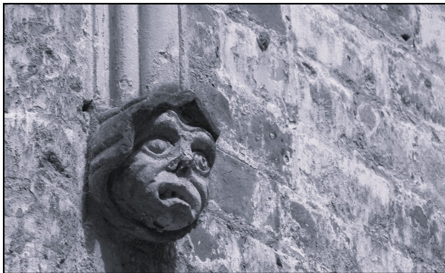
A grotesque on the east side of the inside wall in the Anglican Chapel at Nunhead Cemetery.

Journal of the Friends of Nunhead Cemetery