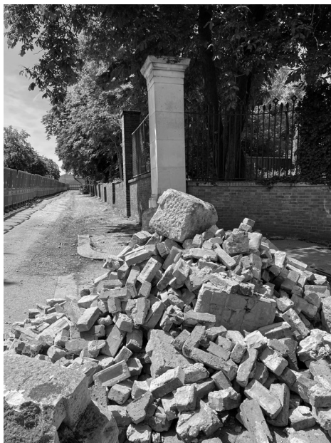
Demolition work in Limesford Road

The Limesford Road boundary wall rebuild - complete with new railings to match those on Linden Grove - as reported on in the last issue of FONC News began on the 10th of June 2024. The work is scheduled to be completed by the end of April 2025. Because of the need to move various services and provide space to work in, Limesford Road itself has been restricted to a single lane, one-way route with vehicles travelling from west to east. Diversion routes have been set out. The Limesford Road entrance will continue to open as usual for the duration of the work. To minimise disruption to residents, and allow on-street parking, the work has been split into two tranches, the first running from the Borland Road end of the walls to the entrance gates, with the second being from the entrance gates to the Ivydale Road end of Limesford Road. It was the intention to salvage as much original material as possible, but the brickwork was