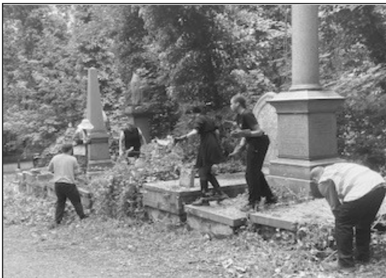
Volunteers removing vegetation from monuments.

teers had a go at both activities and the FONC supervisors were really impressed with their enthusiasm and hard work. Several have subsequently attended our regular practical work and monument inscription recording days. We now hope to make this afternoon taster session a regular event in early June in future years.