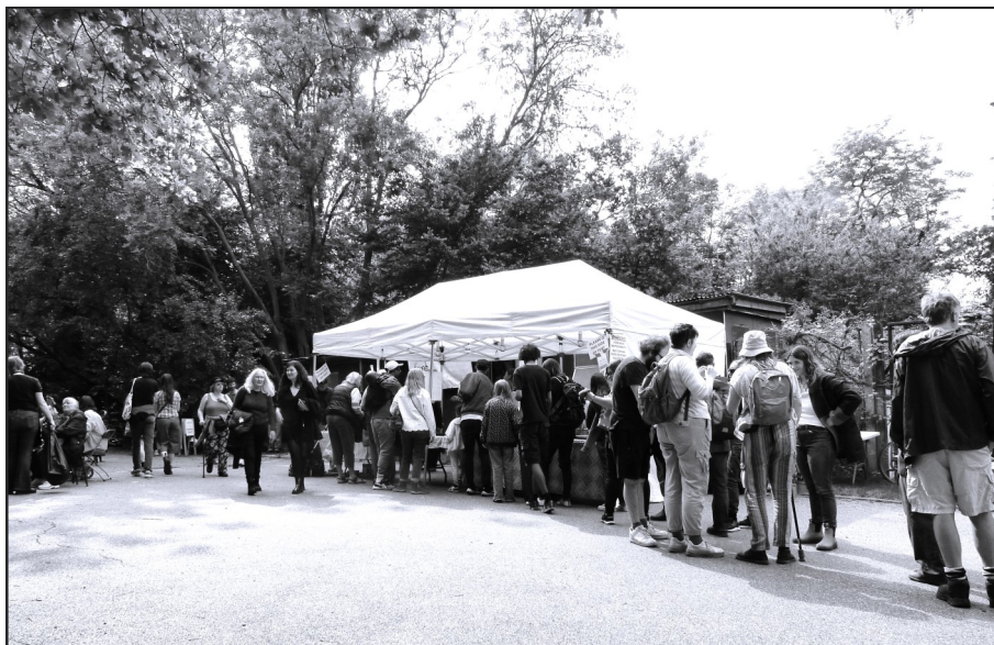
Visitors queuing patiently at the refreshment tent.

trumps again. We also added a number of new stalls and attractions to the event thus delighting the large numbers of visitors and to the obvious enthusiasm and enjoyment of the day.