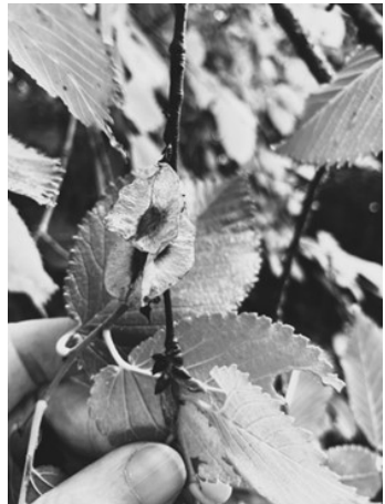
Elm with fruit.

Some of the trees, shrubs and low plants appearing in the cemetery over the next years may be there for more than just their beauty!