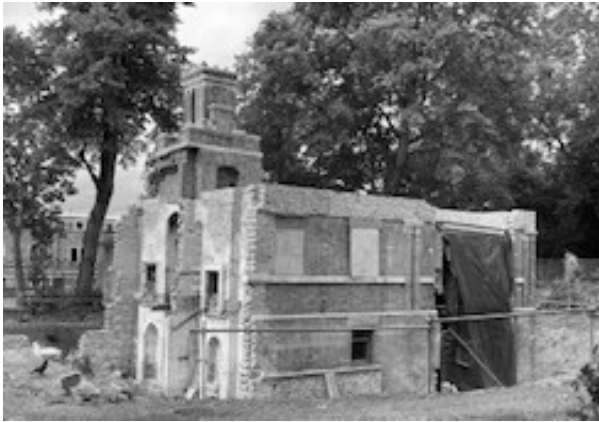
Work on the East Lodge is progressing.

Finally work has started on the restoration work of the East Lodge building. The work started with clearing the site and removing the scaffolding so that the building itself is now more clearly visible. The restoration