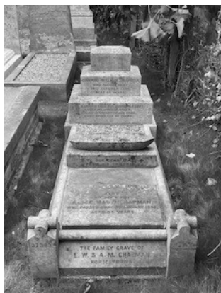
The Chapman grave