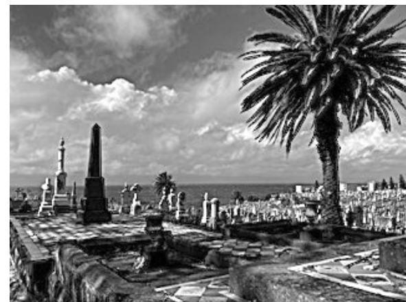
Waverley Cemetery Sydney - Tombs with a View.

Famous people buried at Waverley Cemetery include Australia's first Prime Minister, Edmund Barton, poet Henry Lawson ('the minstrel of the Australian