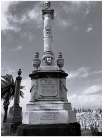
Monument to Henry Kendall