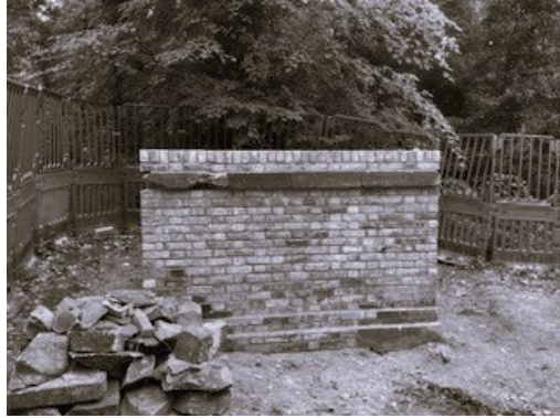
The reconstructed Bevan Mausoleum 2025.