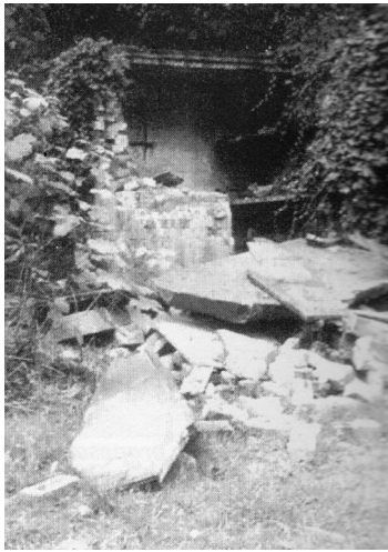
The desecrated Bevan mausoleum in 1972.