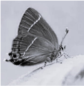
White-letter Hairstreak.

Fortunately, Nunhead Cemetery is home to a number of what we believe to be mature Wych Elms (as well as all the regenerating, but young English Elm).