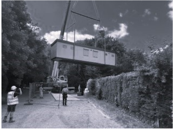
New cabin being lifted into position.

arrived on site four weeks later and was effortlessly lifted into position. The new cabin looks fantastic, but unfortunately, at the time of writing, we are still awaiting handover whilst a few snagging issues are sorted out. These should be resolved by mid-August so FONC can then move into our new home.