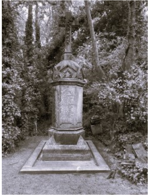
The restored Ravenscroft monument