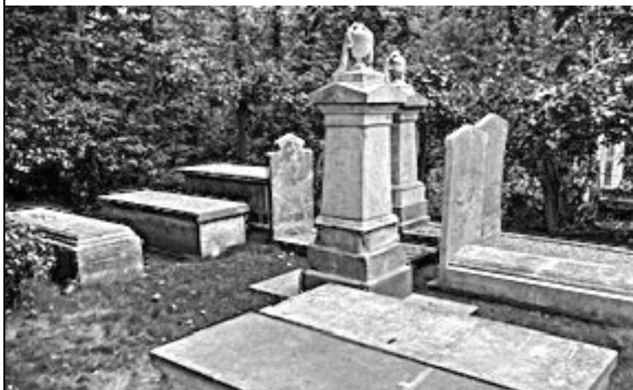
Restored monuments in the East Lodge enclosure. See page 14

Journal of the Friends of Nunhead Cemetery