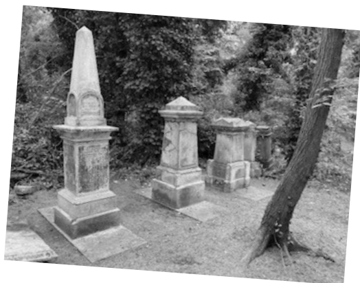
East Crescent group including Robinson obelisk.

memorials have now been restored. The fact that one of these vaults is the repository of the Hart family is purely coincidental!