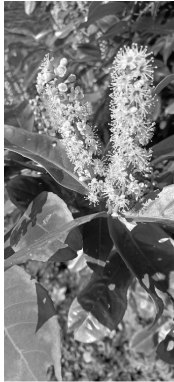
Cherry laurel-Prunus laurocerasus.

It is said that laurel was a favourite poison of the notorious Emperor Nero, 'crushed leaves were soaked in water and the resulting liquid given to unsuspecting victims.' However, despite this, laurel leaves had culinary uses. In Devon, during the 1940s, 'for flavouring milk pudding or old-fashioned blancmange a laurel leaf was dipped in milk, it gave it an almond flavour'.