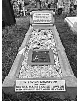
Henry Lawson’s grave

For anyone visiting Sydney, a visit to Waverley Cemetery is highly recommended. The Friends of Waverley Cemetery offer guided tours, usually taking place at 9.00am on Saturday mornings. To book go to friendsofwaverleycemetery@gmail.com